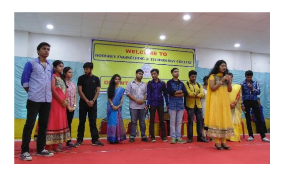
Orientation Programme 2016